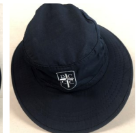
Year 7 to 12

Hat policy - from 1 September to 30 April all students must wear their school hat while outdoors.